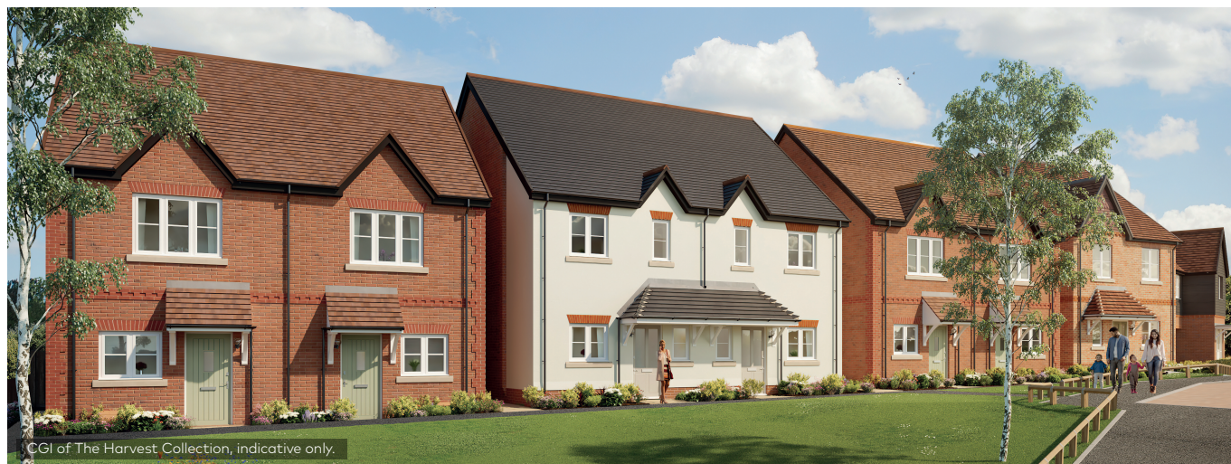
CGI of The Harvest Collection, indicative only.