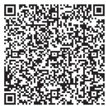
WOODLAND GARDENS HOUSES