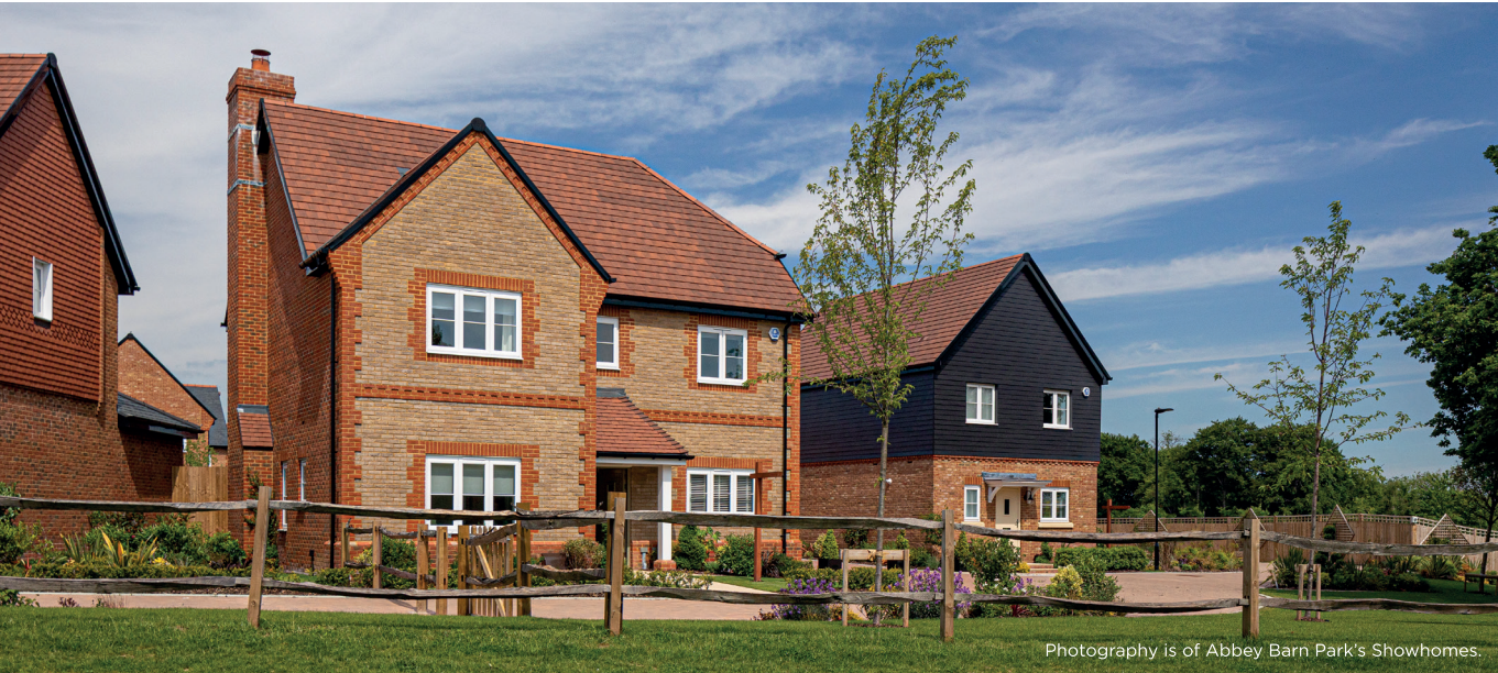
Photography is of Abbey Barn Park's Showhomes.